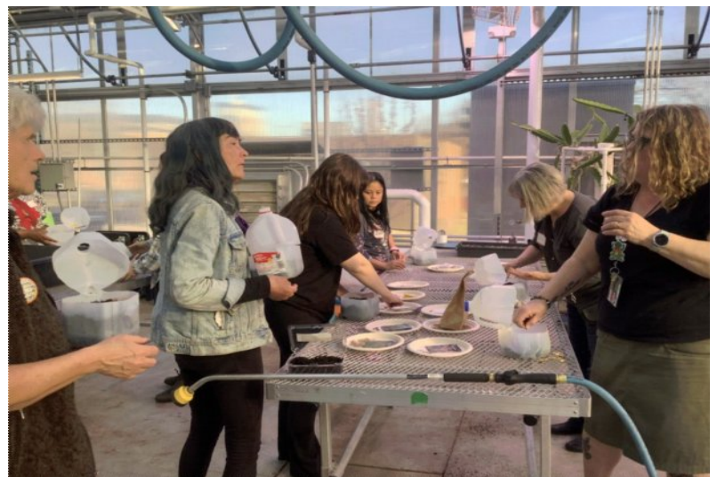
Fun meeting neighbors and starting summer gardens from seeds. From Dayton's Bluff's and Metro State's joint Seed Sowing event.