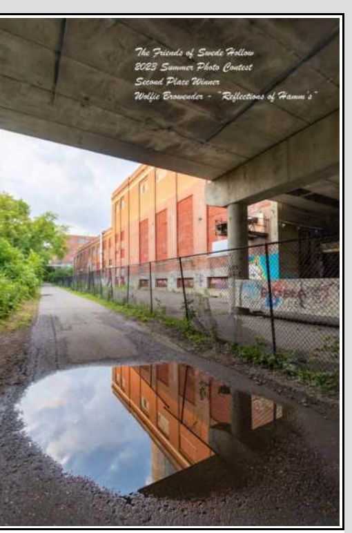
Second Place Winner: "Reflections of Hamm's' by Wolfie Browender

For further information on the East Side Arts Council visit www.eastsideartscouncil.org